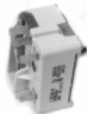
WB 23M24 G.E. Element Control, 1500W, Push to turn, 3/4" Shaft.