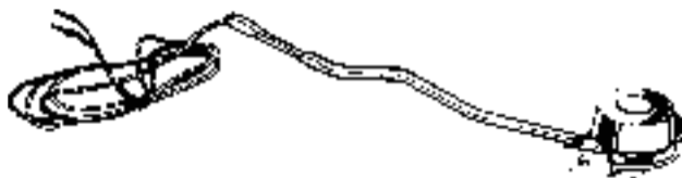
WB 21X5207 G.E./Hotpoint Surface Unit Sensor Yellow. WB 21X5054 G.E./Hotpoint Surface Unit Sensor White.