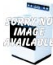
WB 21X5237 G.E. Infinite Heat Switch, Push to turn, 3/4" Shaft.