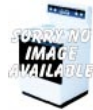
WB 21X5246 G.E. Infinite Heat Switch, Push to turn, 1" Break off Shaft.