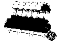
WB 23X5102 (WB 23X40) G.E./Hotpoint Push Button Switch 1" Stems.