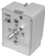
WB 23K5027 G.E. Element Control, Push to turn, 3/4" Shaft.