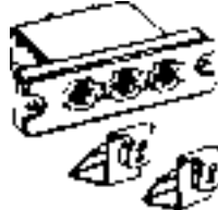
WB 17X105 G.E./Hotpoint Contact Block. WB 2X574 EA G.E./Hotpoint Clips for Blocks.