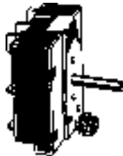
WB 23X5070 G.E./Hotpoint Switch for 3 Wire Burner CW, 1/2" D-Stem Shaft.