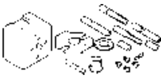
WB 21X5243 G.E./Hotpoint Push to Turn Switch Kit. 1 5/8" Break Off Shaft. (5500-212).