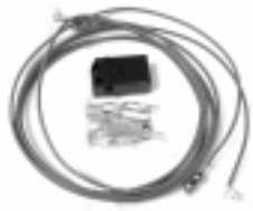
WB 17X210 G.E. Receptacle Assembly and Terminal Block - Plastic.