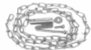
WB 2X7909 G.E. Anti-Tip Kit.