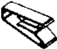
WB 5X5002 G.E./Hotpoint Terminal.