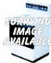
WB 21X162 G.E. Responder.