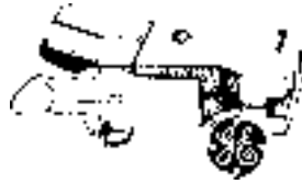
WB 17X5051 G.E./Hotpoint Ceramic Receptacle. For Original G.E. Style Plug-in Burners.