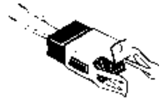
WB 17X5113 G.E./Hotpoint Plastic Receptacle. Fits Regular Style Burners.